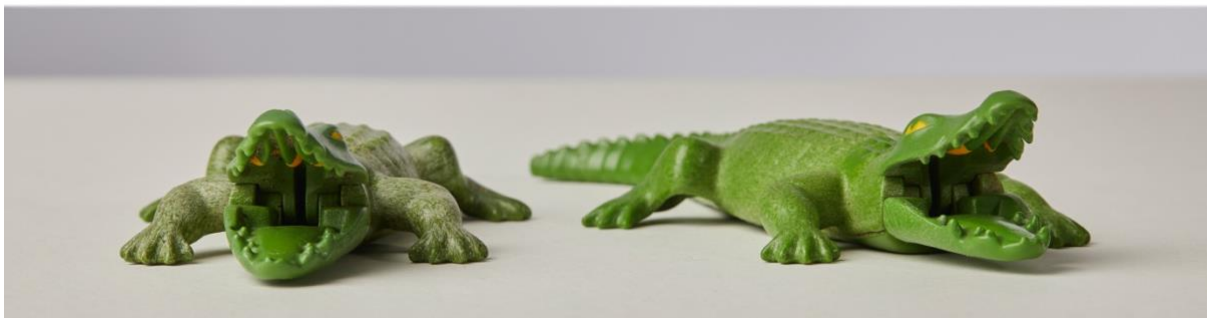
Toy crocodiles with articulated jaws.

Top: Egypt c.2500BCE;