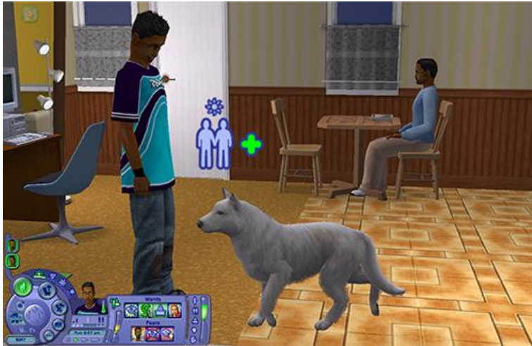
The Sims 2: Pets. Maxis / EA 2004.