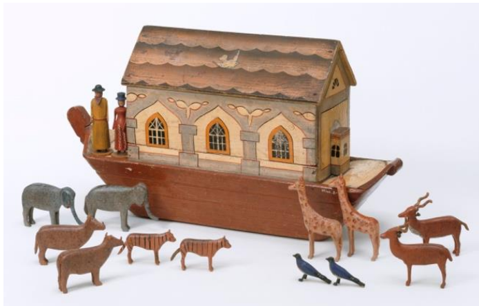
Top: teddy bear, UK, 1960s;